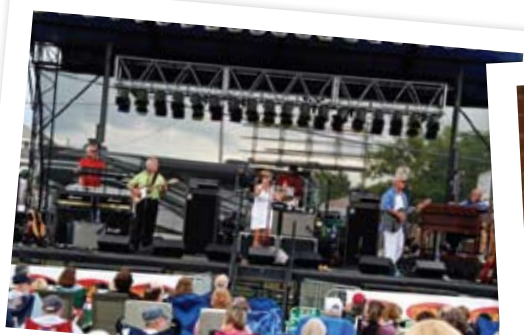
Ooh La La and the Greasers