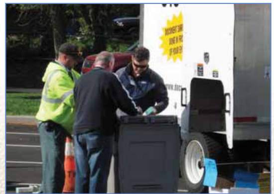
The Document Shredding Program for Township residents only was held on Saturday, April 17 behind the Administration Building at 8540 Kenwood Road.