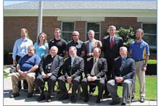
Sycamore Township National Day of Prayer Ceremony held May 6, 2010 at the Sycamore Township Administration Office.