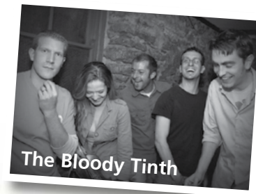
The Bloody Tinth

Community picnic and concert. Brats, metts, and burgers for sale. Fabulous American-Irish music by The Bloody Tinth , one of the region's top Irish bands.