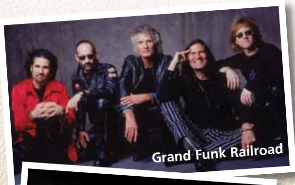
Grand Funk Railroad