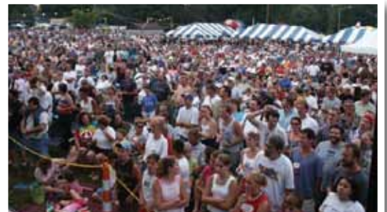
Festival in Sycamore