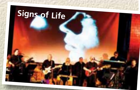
Signs of Life

McDaniel Sports Complex – Enjoy the great sounds and show by Signs of Life (a Tribute to Pink Floyd).