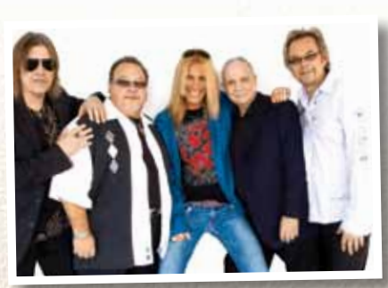
The Guess Who

of national, local, and regional acts. The Festival will also feature the return of The Rusty Griswolds to the Festival in Sycamore. The Festival will again feature a great variety of delicious foods from many area restaurants, all reasonably priced. There will be games and rides for the kids. We're bringing back the "RIDE FOR FIVE $" again this year. Buy a bracelet for $5 each day and your child can ride as much as he or she wants.