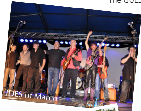
IDES of March

BRONZE SPONSORS: Strawser Construction, Terry Asphalt, Rumpke, Alleen Co., Brookwood Retirement Center, Midland Atlantic, Besl Transfer, United Refrigeration, Dillonvale Shopping Center, Camp Safety Equipment