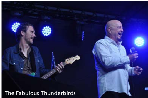
The Fabulous Thunderbirds