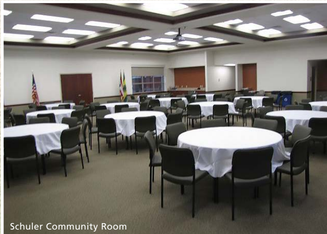
Schuler Community Room