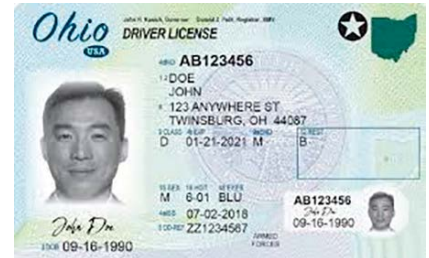
Compliant Drivers License

As of October 1st, 2020, the Federal Government will no longer consider your normal, state-issued driver's license or I.D. card as a proper form of identification for commercial air travel within the United States. The Transportation Security Administration (TSA) will require a new, federally compliant driver's license in order to fly. This program began in Ohio in July of 2018. However, a significant number of Ohioans have not initiated the process of obtaining their new federally compliant driver's license. A recent report by one of our major, local news outlets reported that over fifty percent of Americans either do not know of the new regulations, or have not obtained their new credentials.