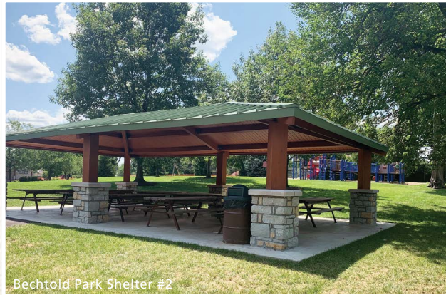
Bechtold Park Shelter #2