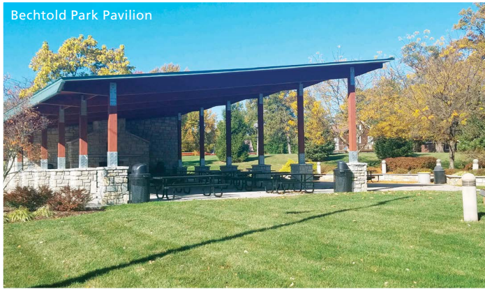
Bechtold Park Pavillion

Planning a picnic, graduation party, family reunion, meeting, or any kind of friendly get together? Consider renting a shelter at Bechtold Park or the Community Room at the Schuler Sports Complex. They are available at very reasonable prices. To check availability or make a reservation for Bechtold Park Shelters or the Community Room, go to our website at www.sycamoretownship.org . Please call (513) 791-8447 with any questions or for more information.