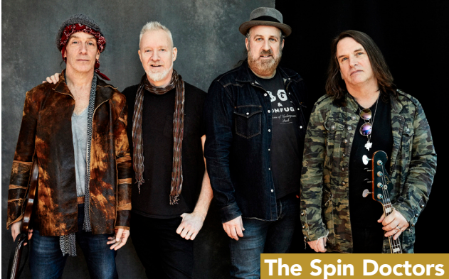
The Spin Doctors