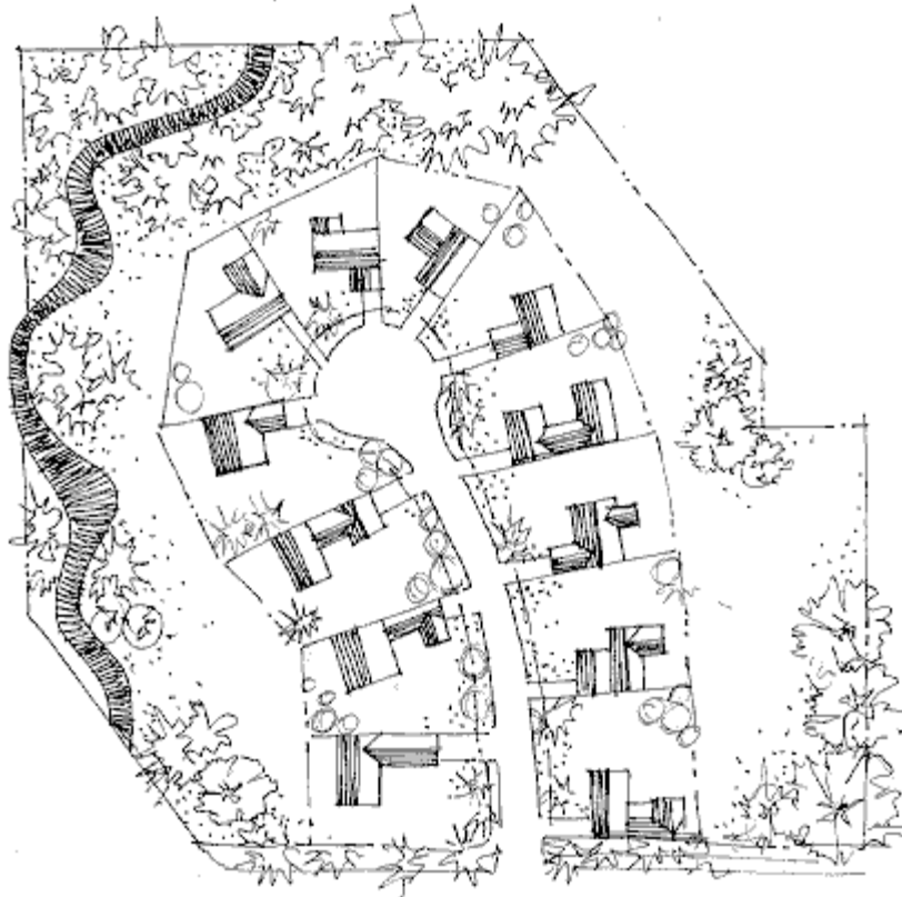
EXAMPLE OF SITE PLAN TOWNHOUSE DWELLINGS