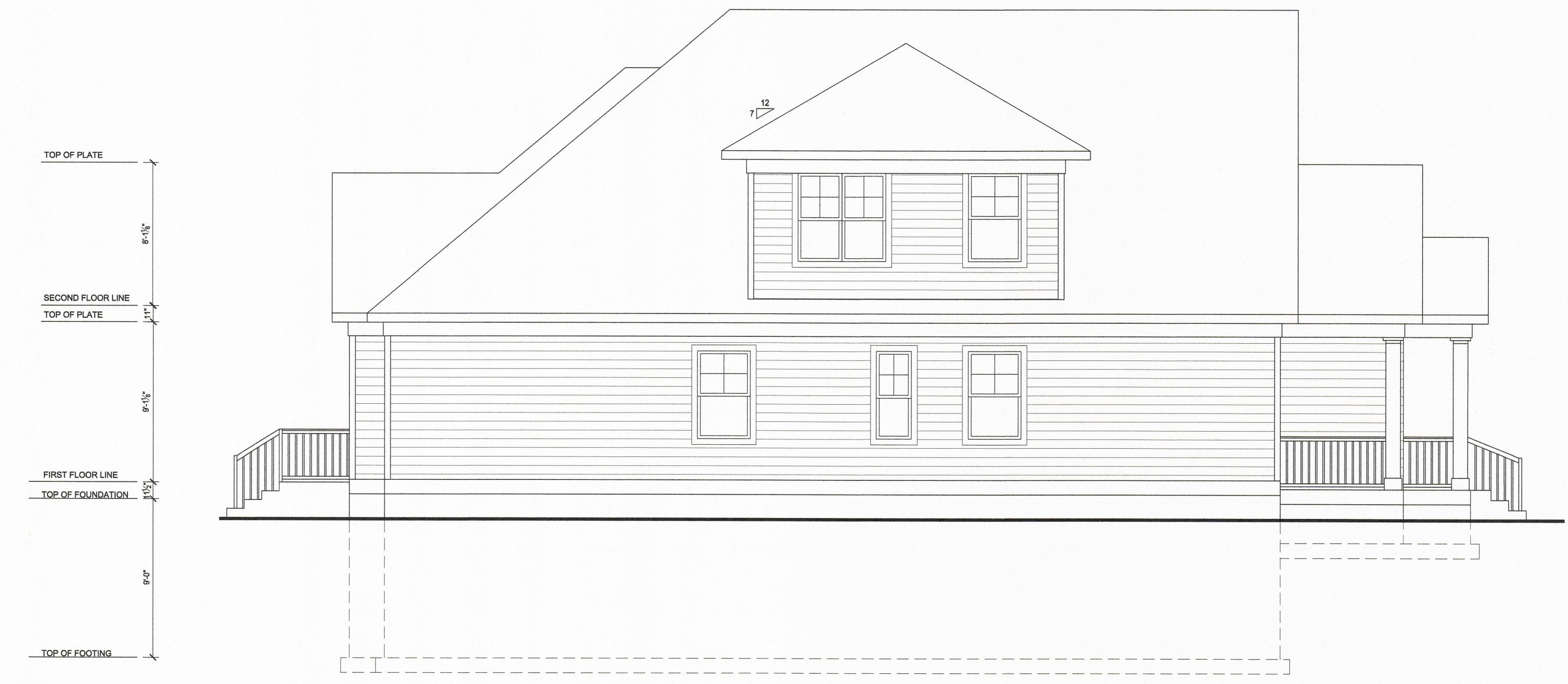
Side Elevation Scale: 3/16" = 1'-0"