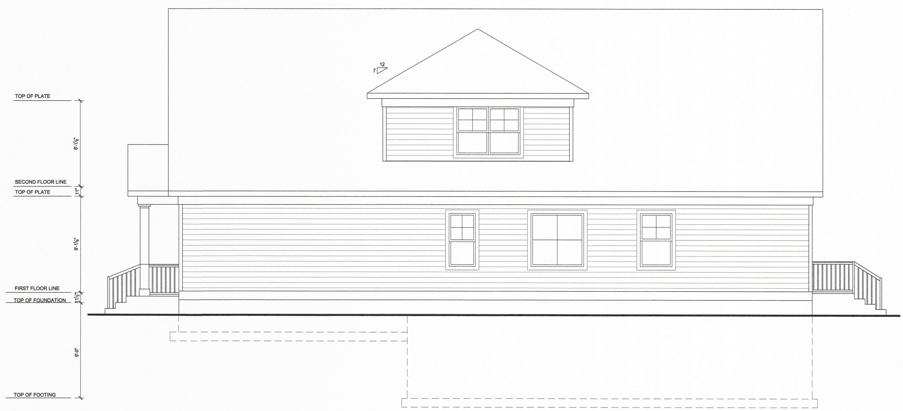
Side Elevation Scale: 3/16" = 1'-0"