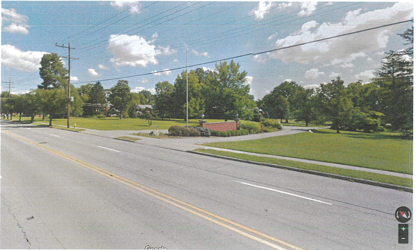
North View of the Old Entrance on Kenwood Rd