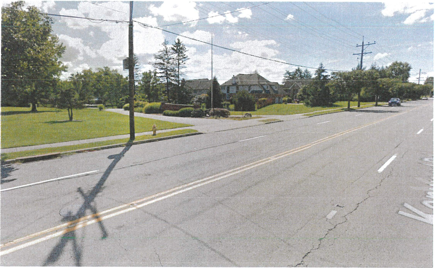
South View of Old Entrance on Kenwood Rd, New Sign would be located approximately where the old flag pole stood