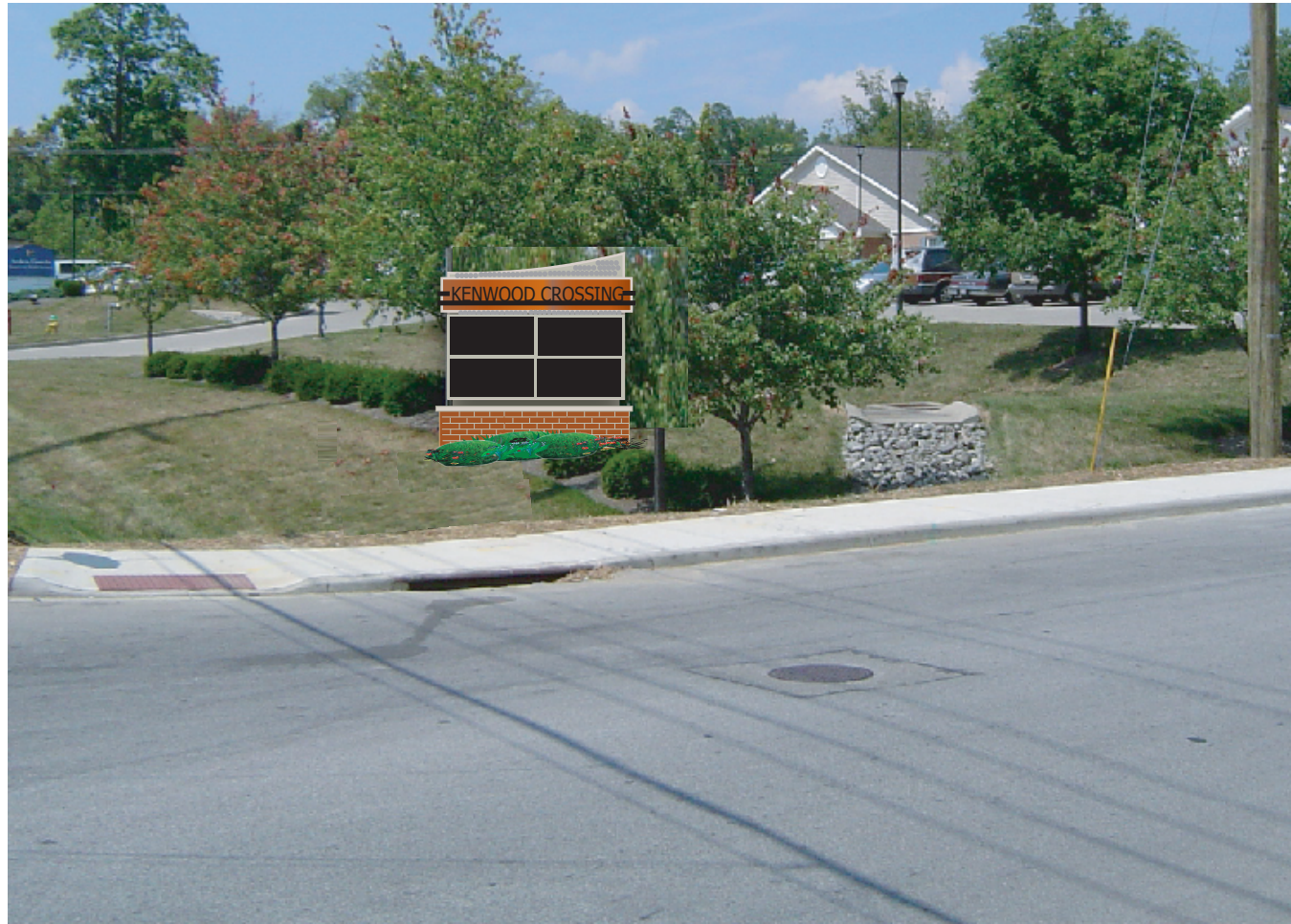
← WEST BOUND on Galbraith Rd.