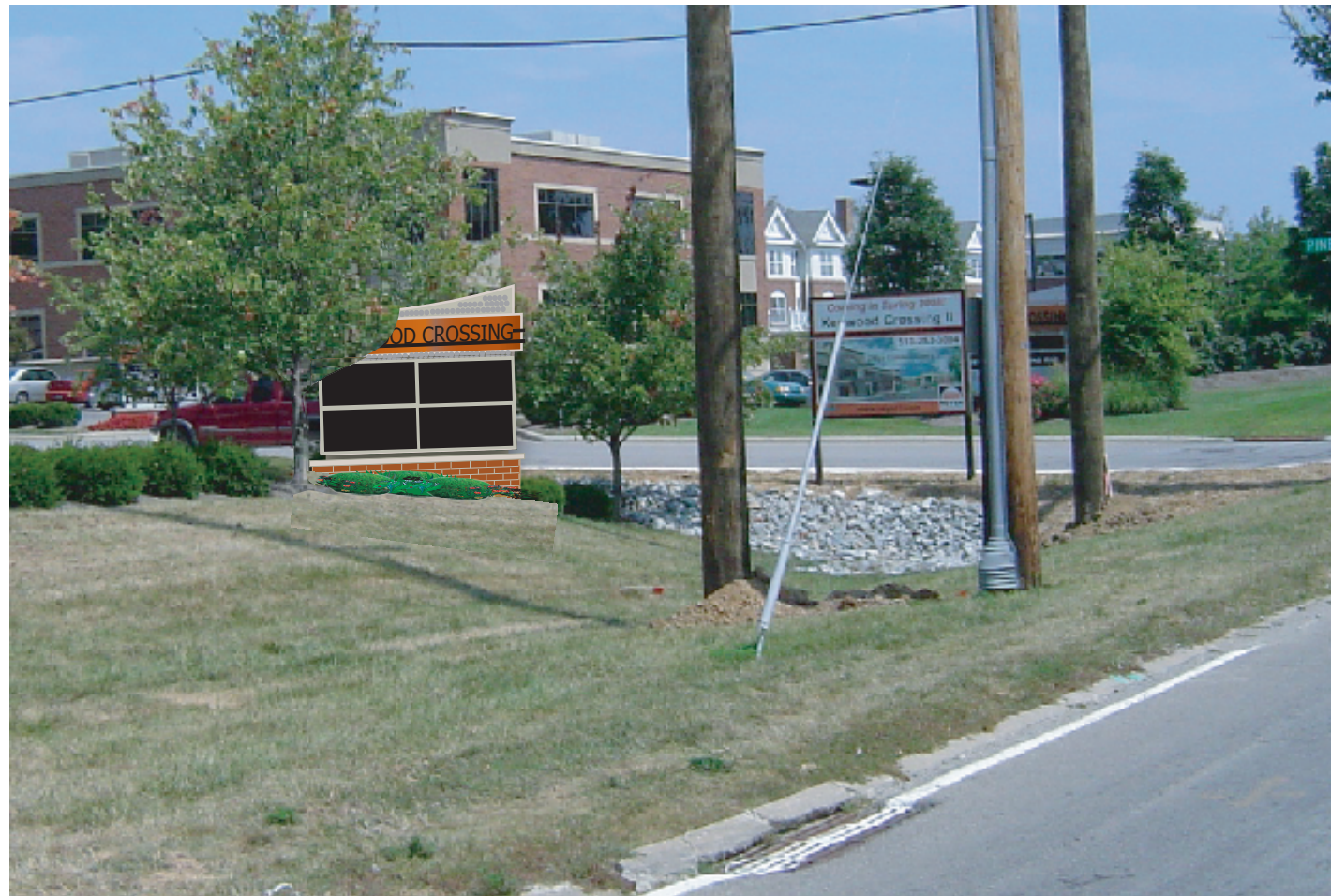
EAST BOUND on Galbraith Rd. →