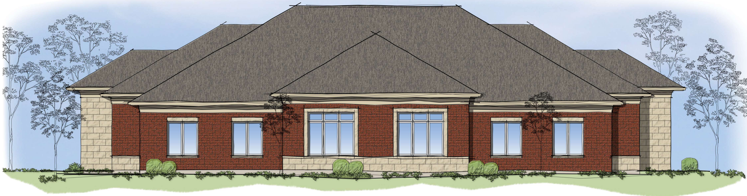
RIGHT SIDE ELEVATION 2 AI 1/8"=1'-0"