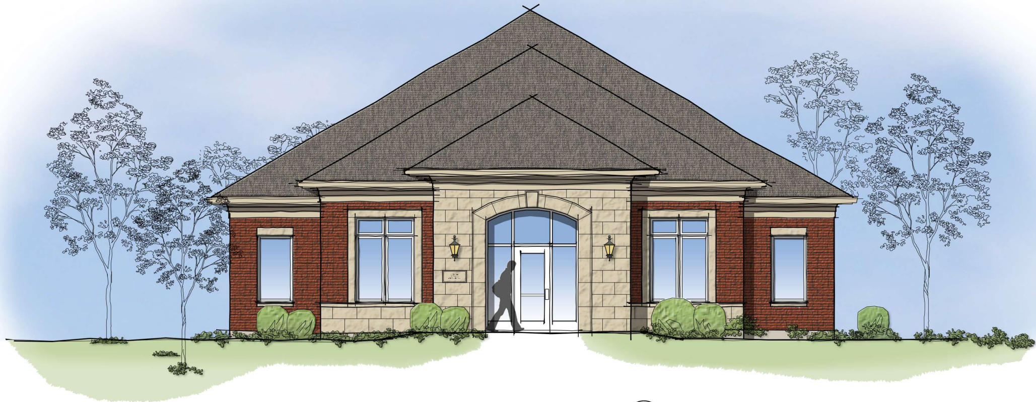
FRONT ELEVATION 1 AI 1/8"=1'-0"