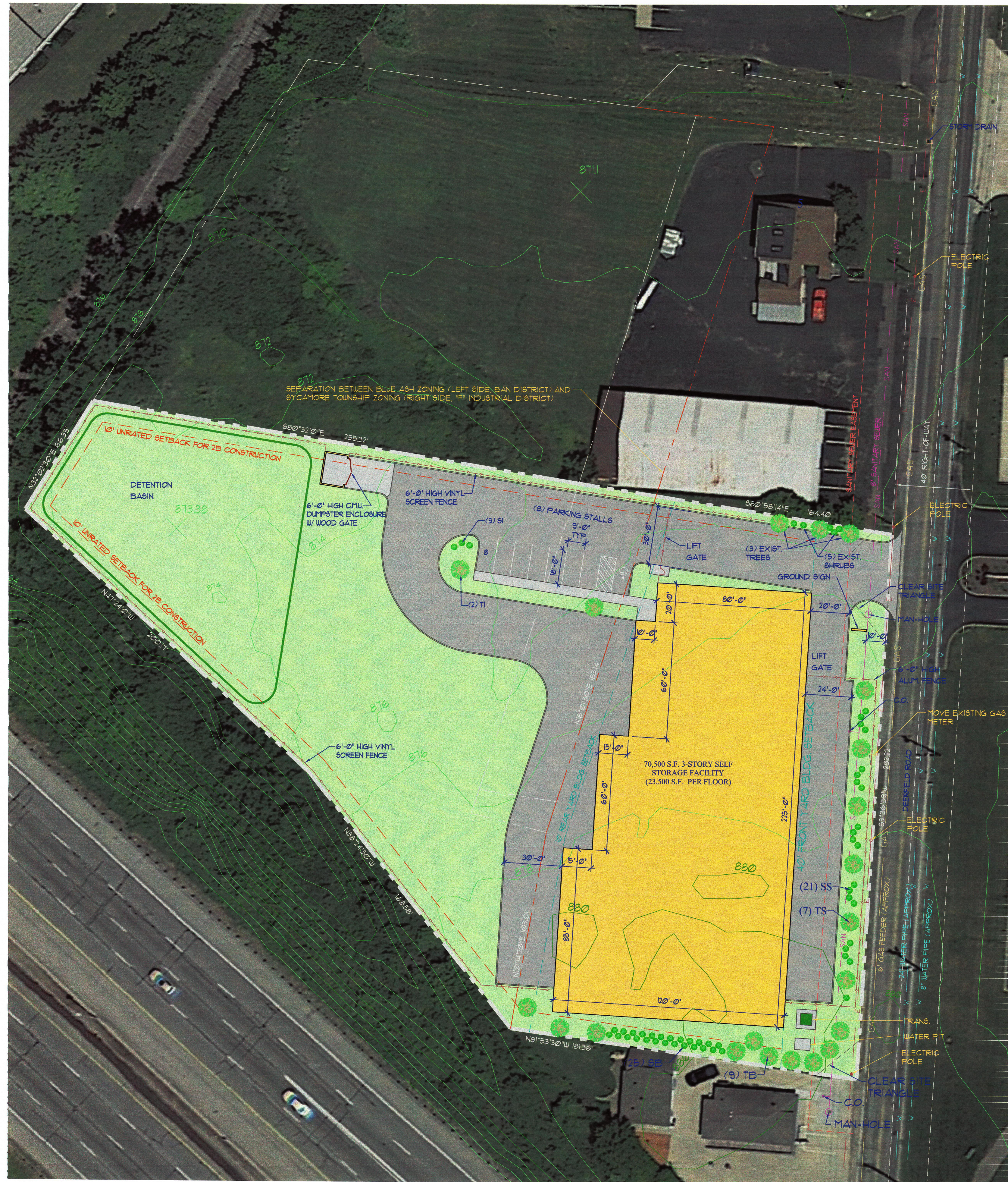
ZONING SITE PLAN (SCHEME "F") SCALE: 1" = 30'-0"

ISSUE DATE: 10/15/20 FILENAME: 20132 - 11573 Deerfield Road - Cherokee Self Storage Zoning Site Plan (Scheme F).dwg PLOTTED BY: bdbill PLOT DATE: Oct 28, 2020-10:32AM