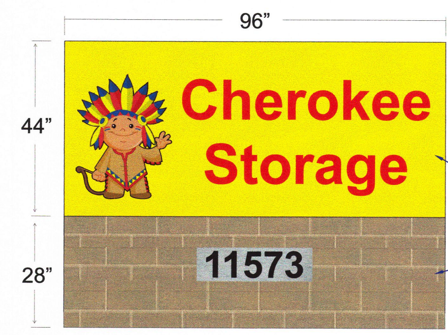
GROUND SIGN DETAIL SCALE: 1/2" = 1'-0"

INTERNAL PARKING AND CIRCULATION AREA = 13,748 S.F. REQUIRED PARKING LANDSCAPING AREA = 13,748 x 5% = 687 S.F. PROVIDED PARKING LANDSCAPING AREA = 1,061 S.F.