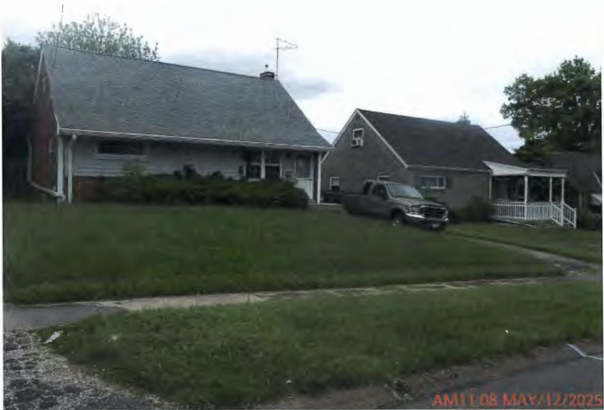
3925 Limerick Ave