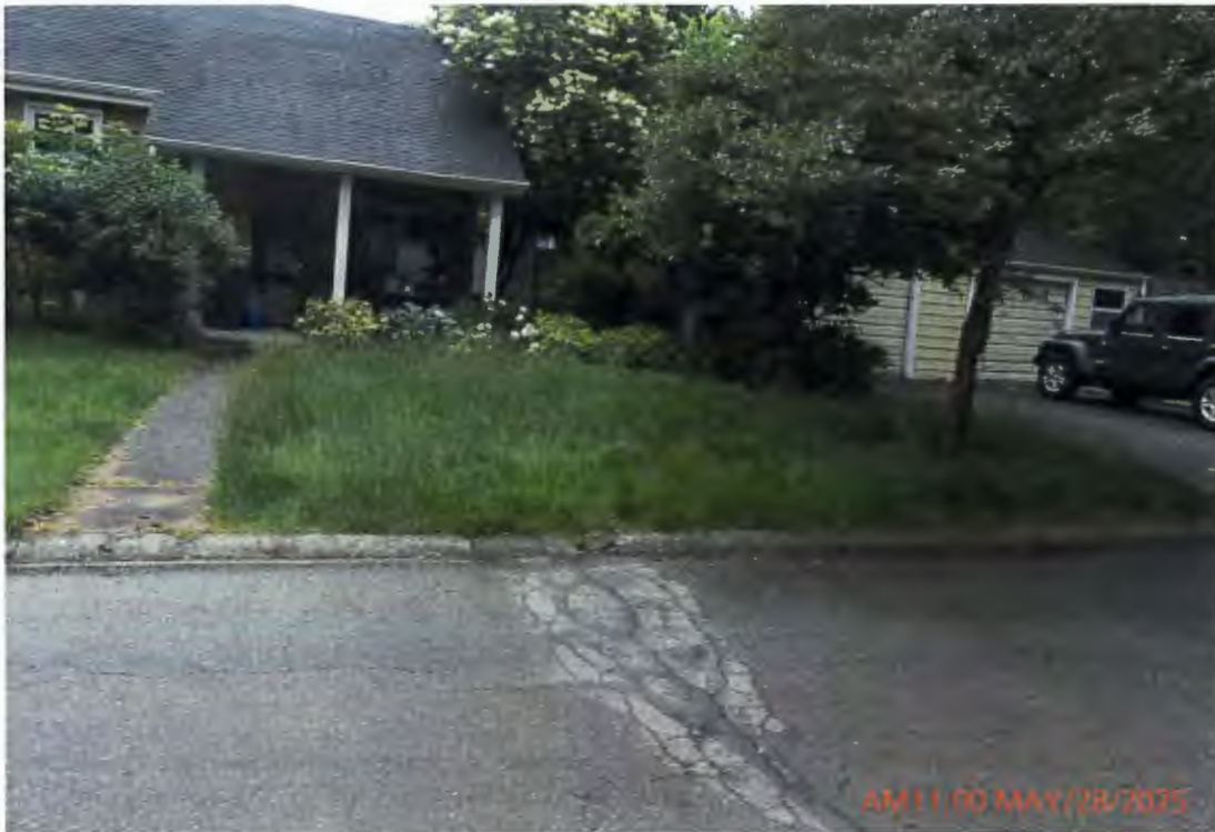
12173 Seventh Ave